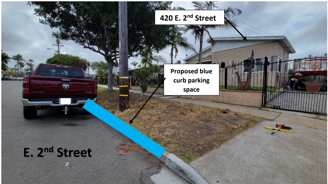
Location of proposed blue curb disabled persons parking space in front of 420 E. 2nd Street (looking east)