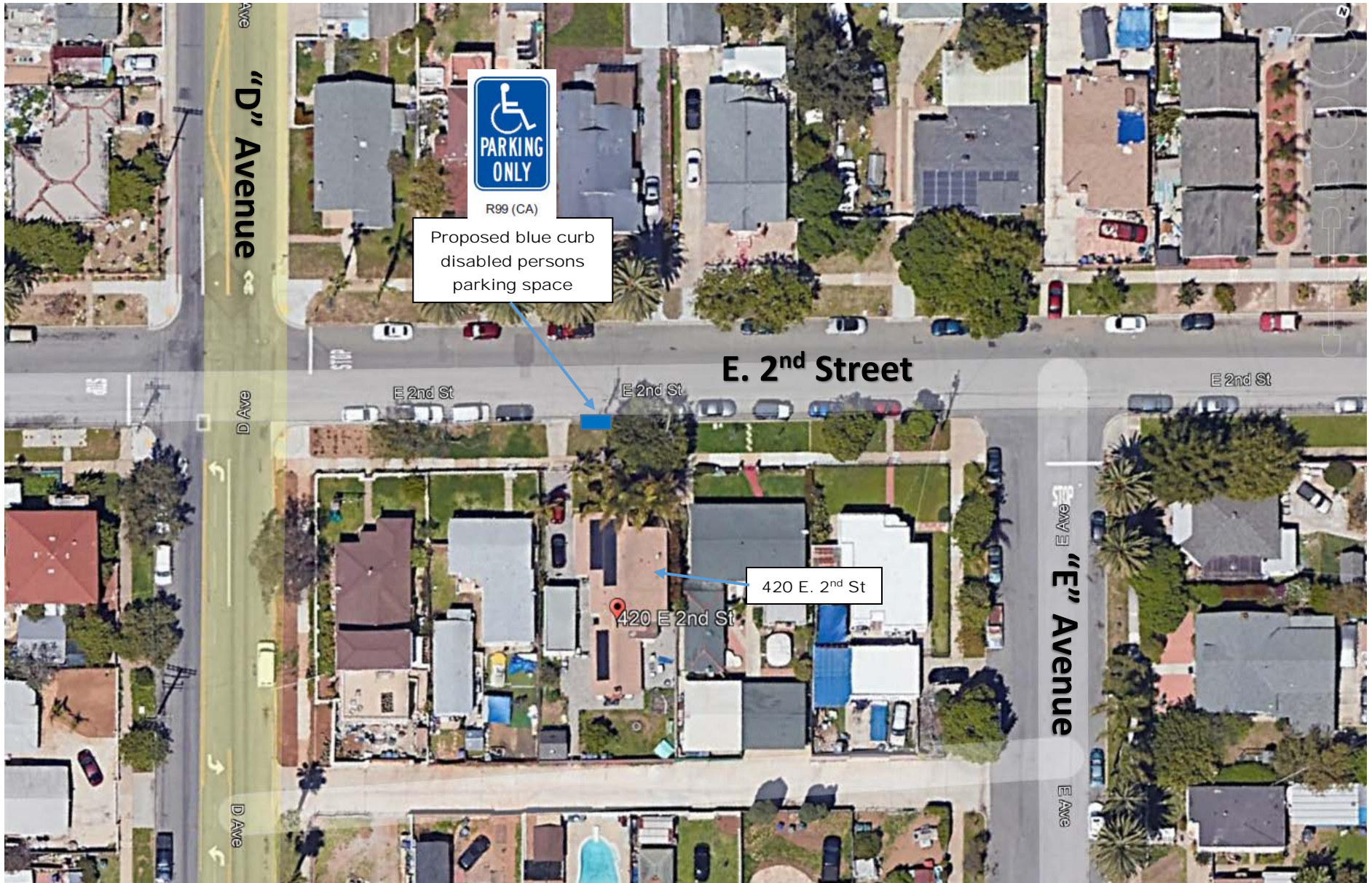
Exhibit "A" - Location Map with Recommended Enhancements (TSC Item: 2022-06)