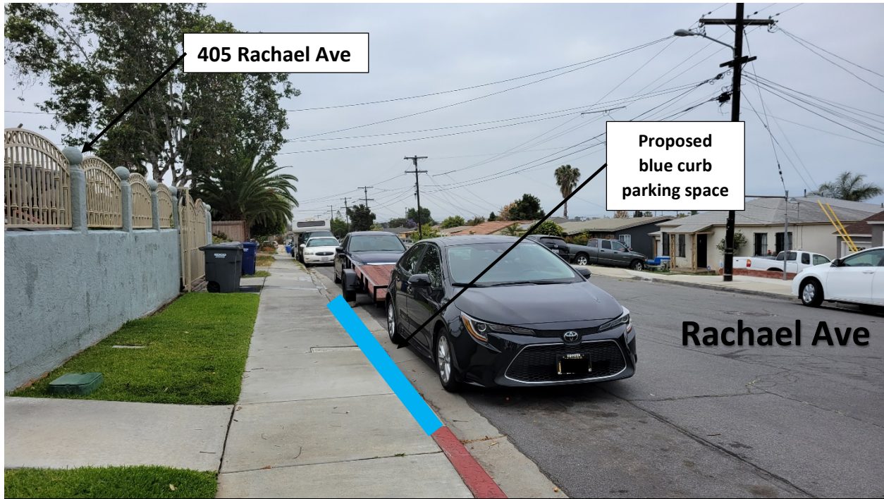
Location of proposed blue curb disabled persons parking space in front of 405 Rachael Ave (looking south)