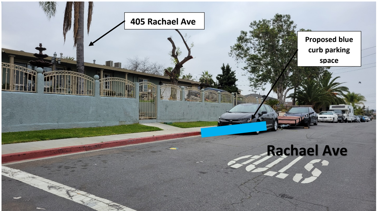
Location of proposed blue curb disabled persons parking space in front of 405 Rachael Ave (looking east)