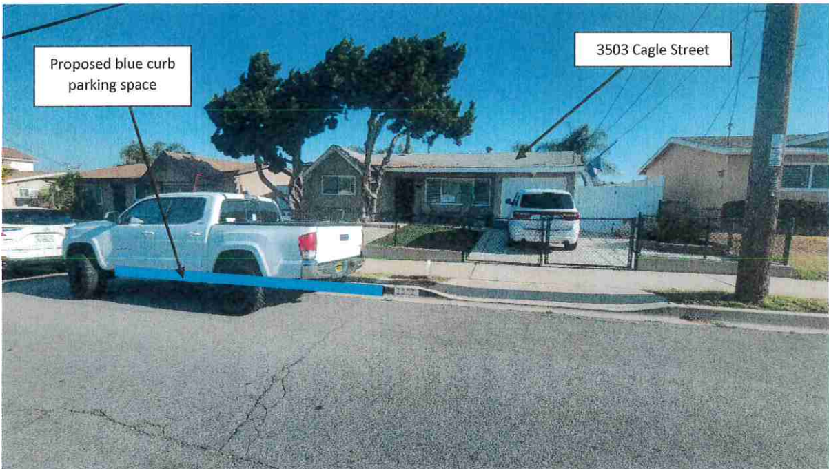
Location of proposed blue curb disabled persons parking space in front of 3503 Cagle Street (looking north)