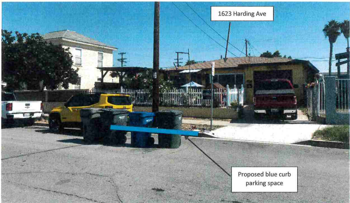
Location of proposed blue curb disabled persons parking space in front of 1623 Harding Ave (looking east)