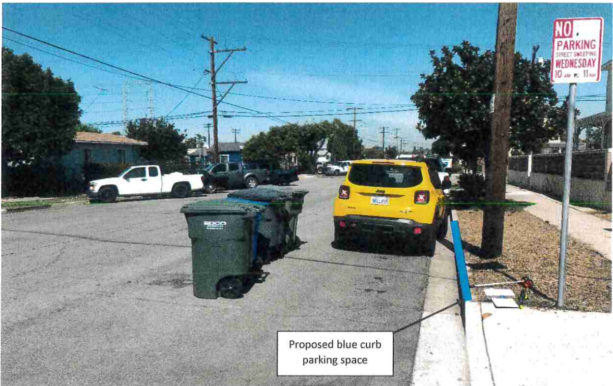
Location of proposed blue curb disabled persons parking space in front of 1623 Harding Ave (looking north)