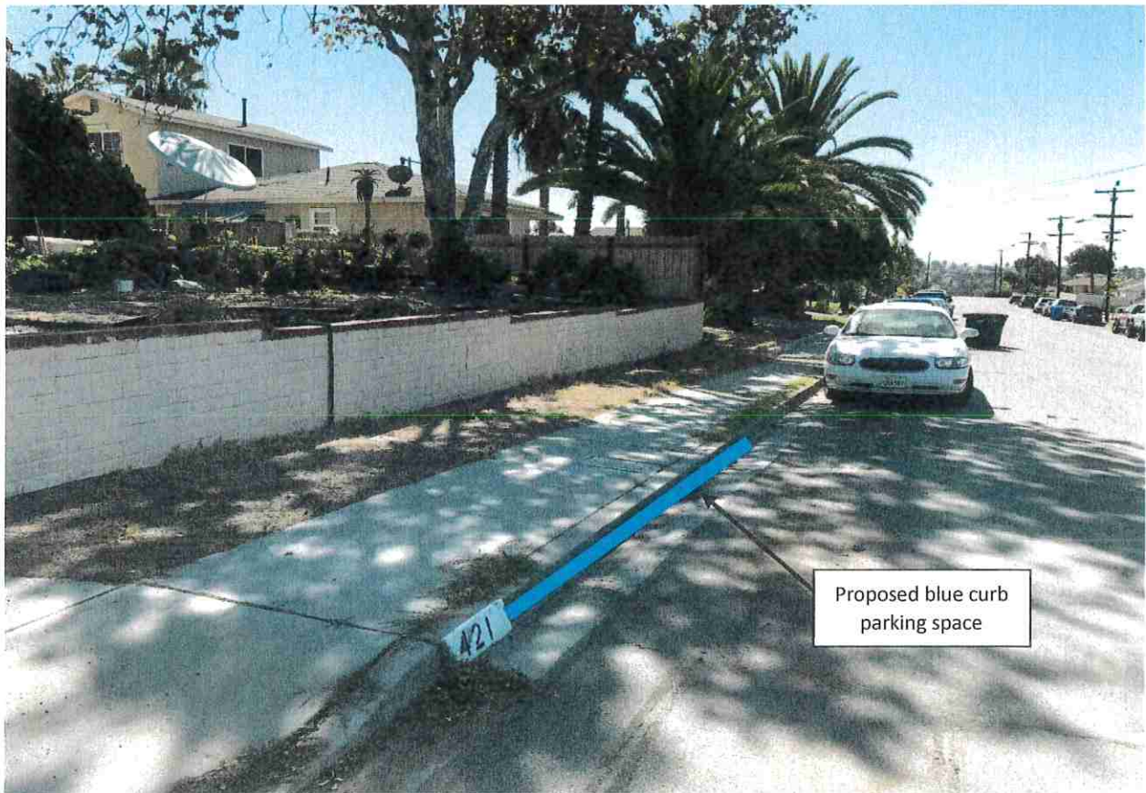
Location of proposed blue curb disabled persons parking space in front of 421 Rachael Ave (looking south)