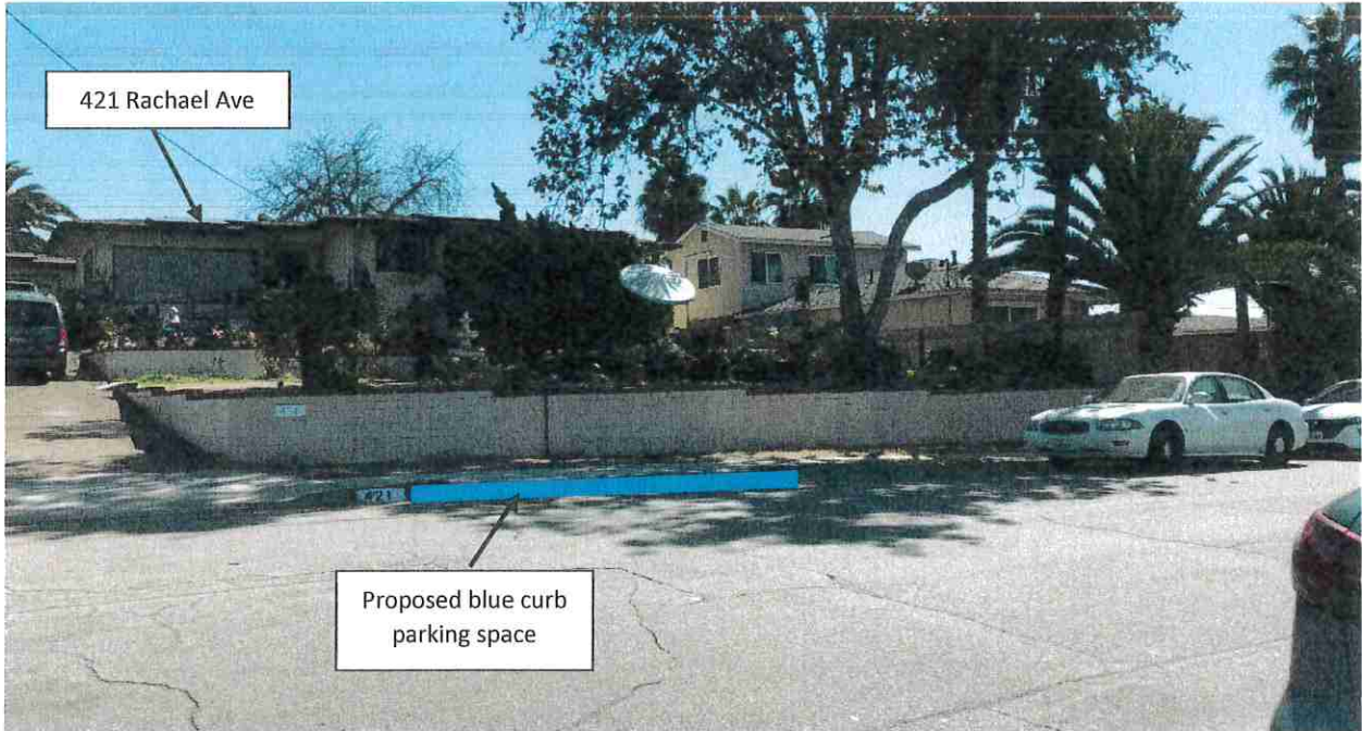
Location of proposed blue curb disabled persons parking space in front of 421 Rachael Ave (looking east)