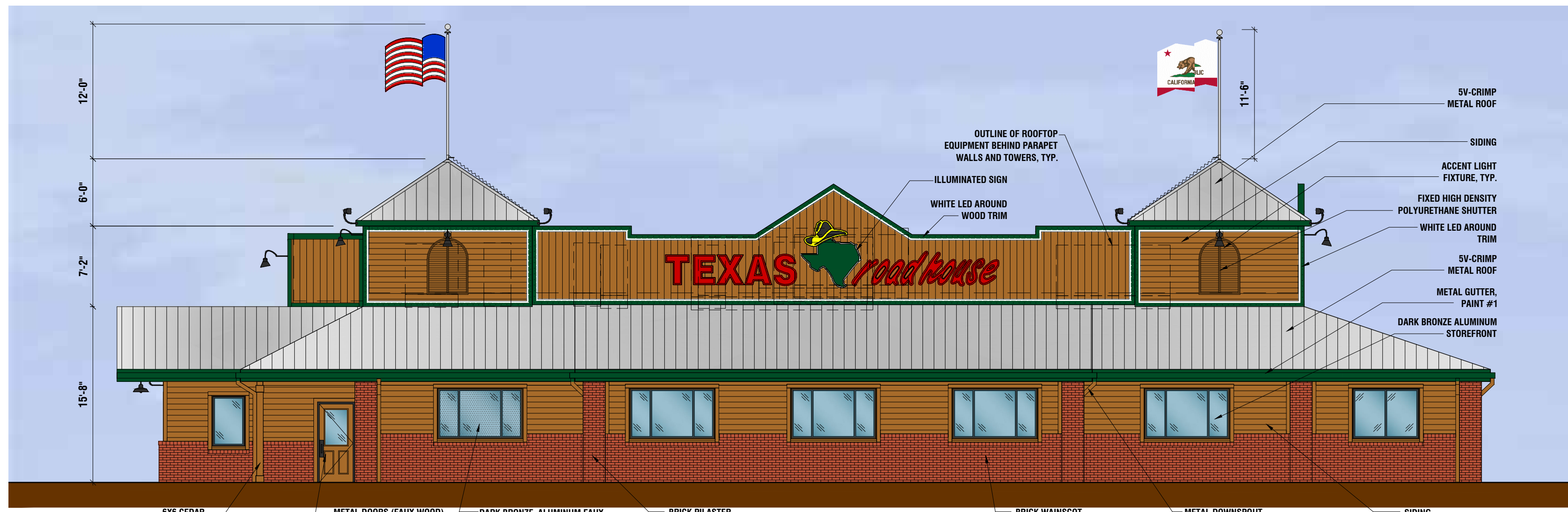
FRONT ELEVATION (SOUTH)