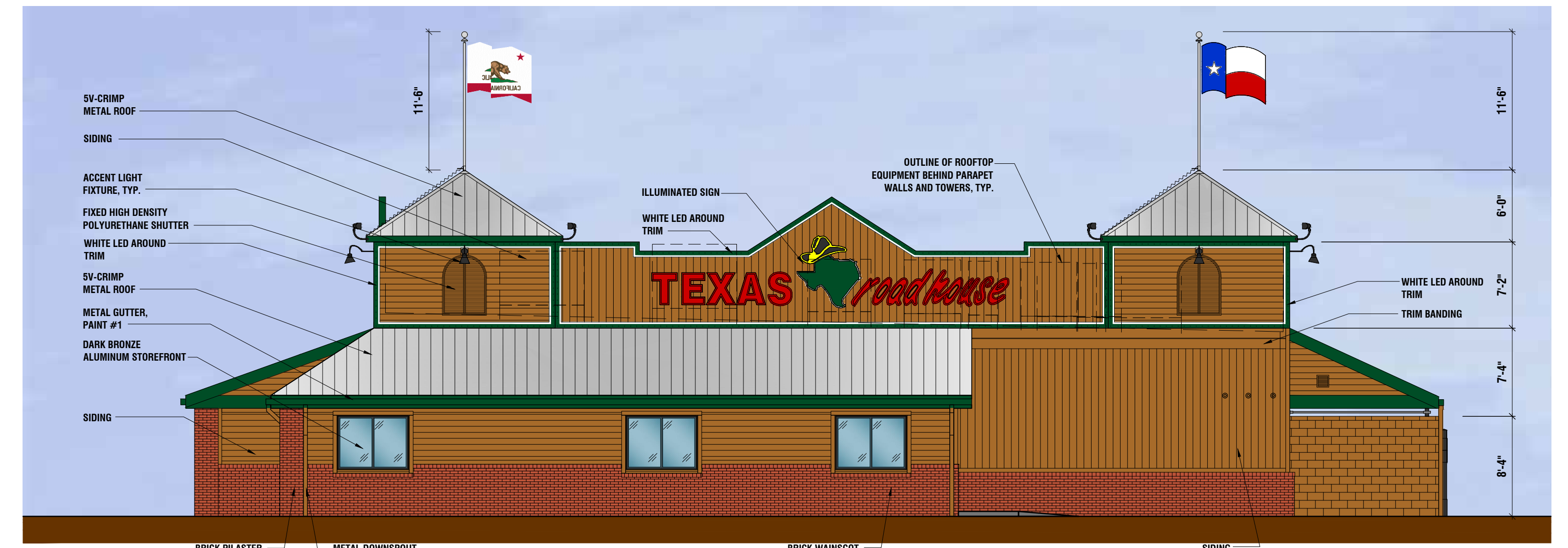
RIGHT ELEVATION (EAST)