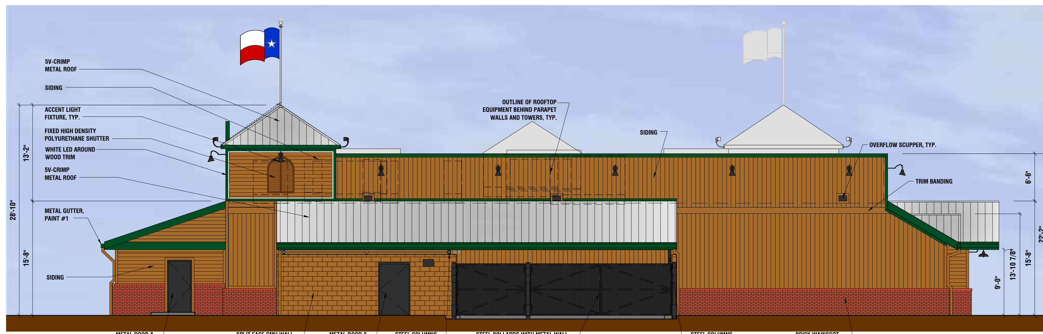
REAR ELEVATION (NORTH)