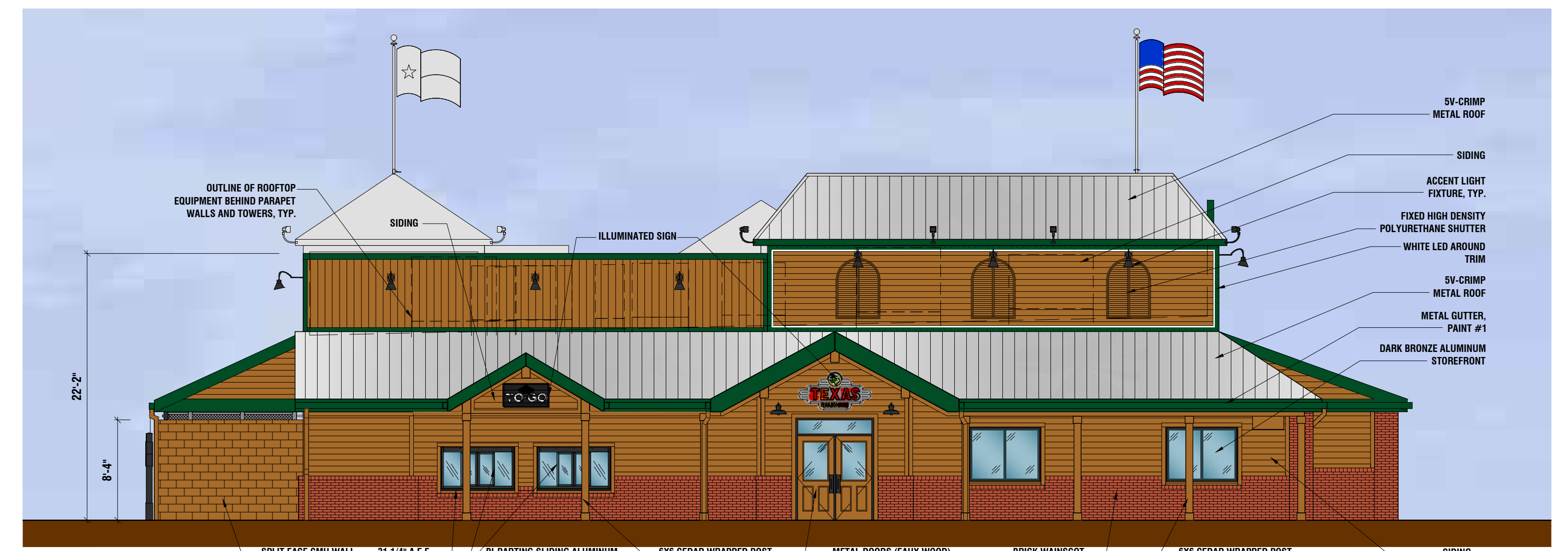
LEFT ELEVATION (WEST)