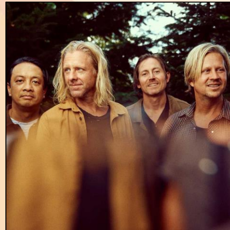
Switchfoot July 3