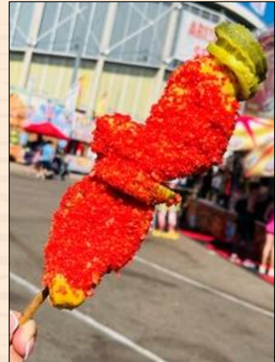
Hot Cheeto Chicken on a Stick