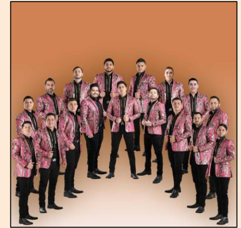
La Adictiva June 11