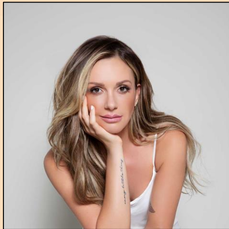
Carly Pearce June 14