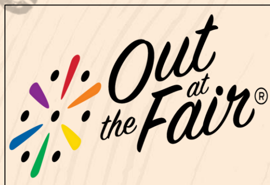
Out at the Fair June 10