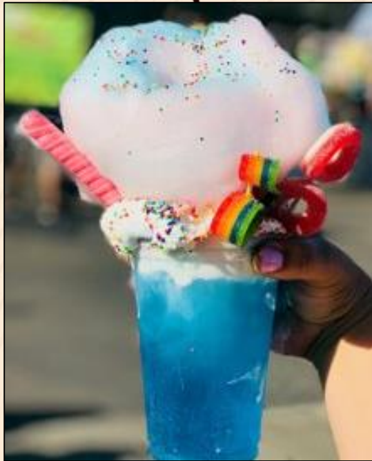
The Mermaid Float