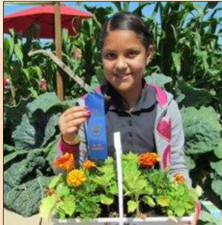
Plant * Grow * Eat