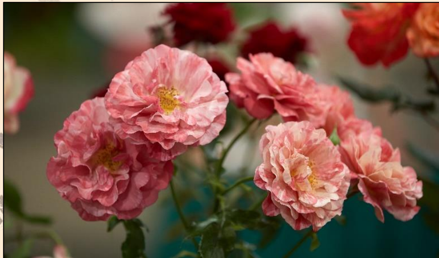
Paul Ecke Jr. Flower & Garden Show