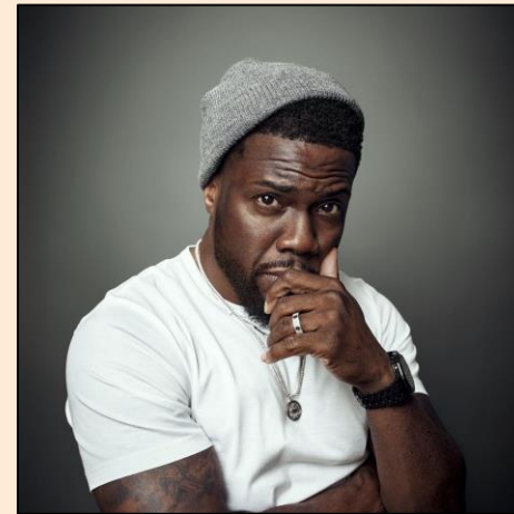
Kevin Hart June 9