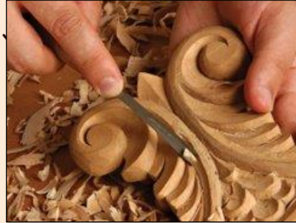
Design in Wood