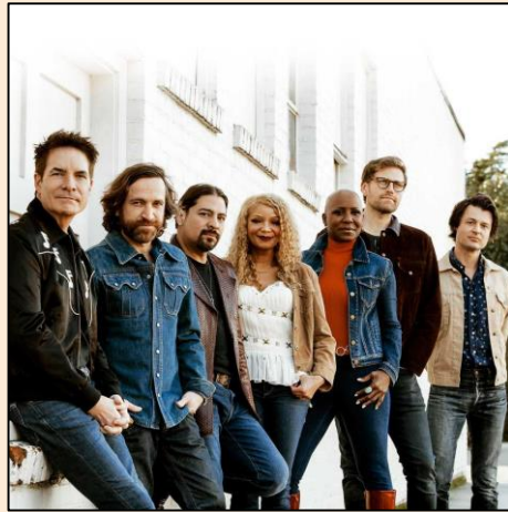
Train June 7