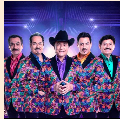
Los Tigres del Norte June 25