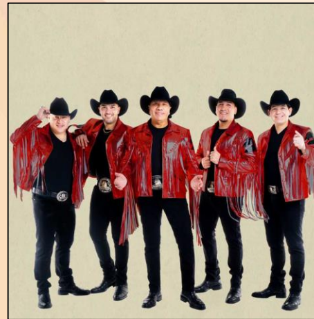
Grupo Bronco June 18