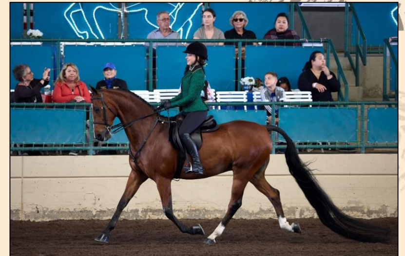
The Horse Show Experience