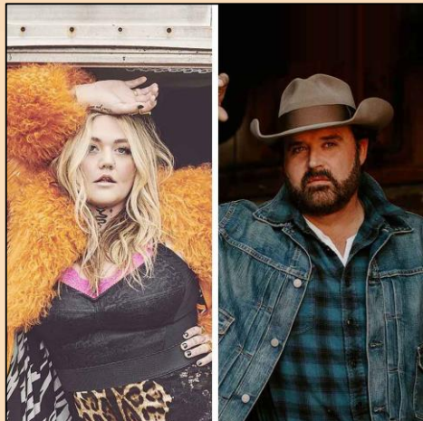
Elle King & Randy Houser June 29