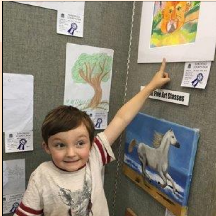
Student Showcase / Best of Pre-K—6