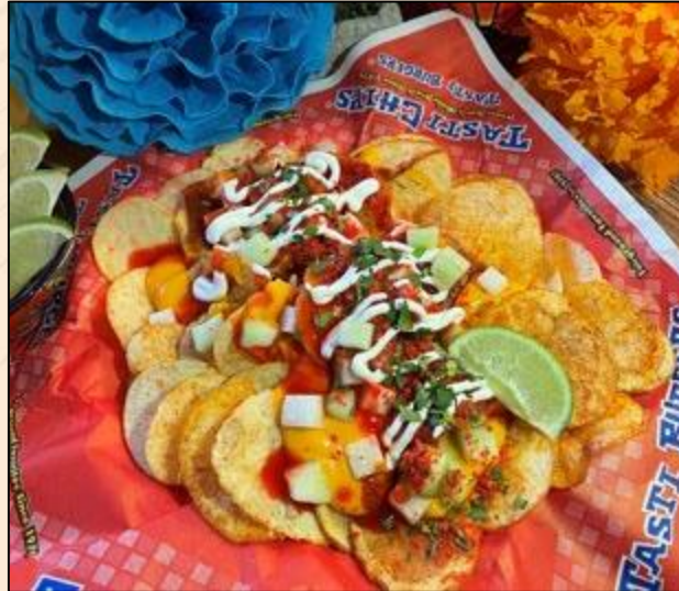
Tasti Papas Locas