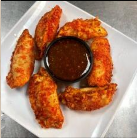
Deep Fried Chicken Potstickers rolled in Hot Cheetos