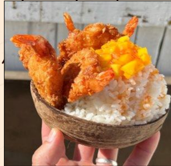
Coconut Shrimp in a Coconut