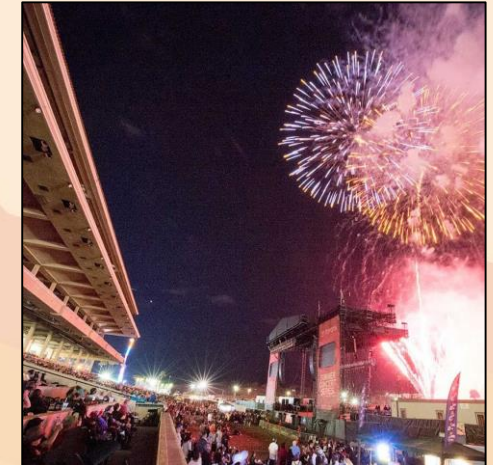
Fireworks July 4