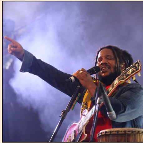
Stephen Marley with Hirie June 24