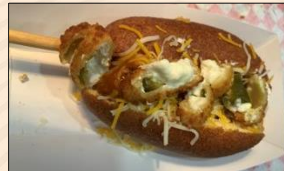
Cheese on a stick stuffed with jalapeno poppers, cheese curds, chili