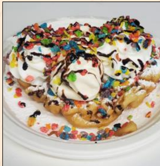
Heart-shaped Funnel Cake