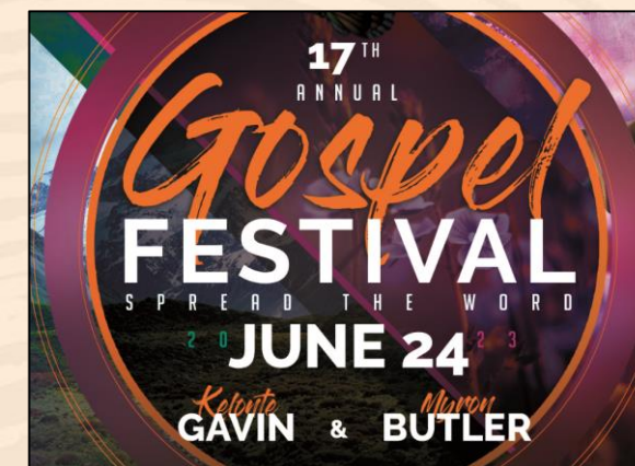
Gospel Festival June 24