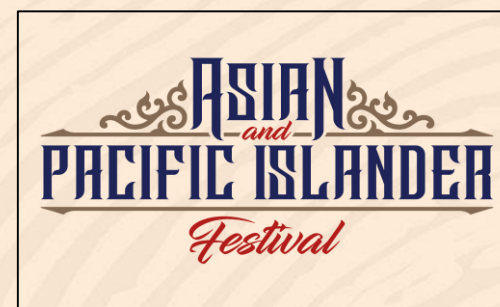
Asian & Pacific Islander Festival June 17