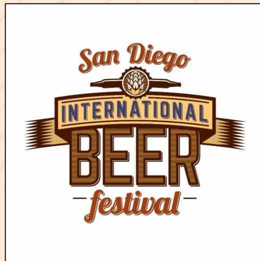
San Diego International Beer Festival + Distilled July 1