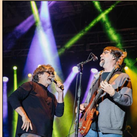
Alabama July 1