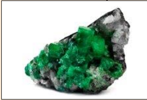
Gems & Minerals