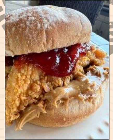
Peanut Butter & Jelly Fried Chicken Sandwich