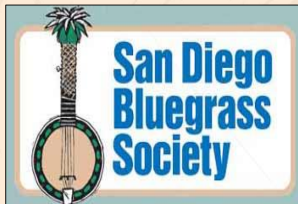
Bluegrass Day at the Fair June 11