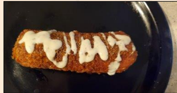
1-lb. Block of Fried Mozzarella