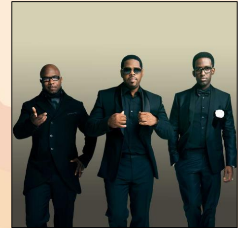
Boyz II Men June 22