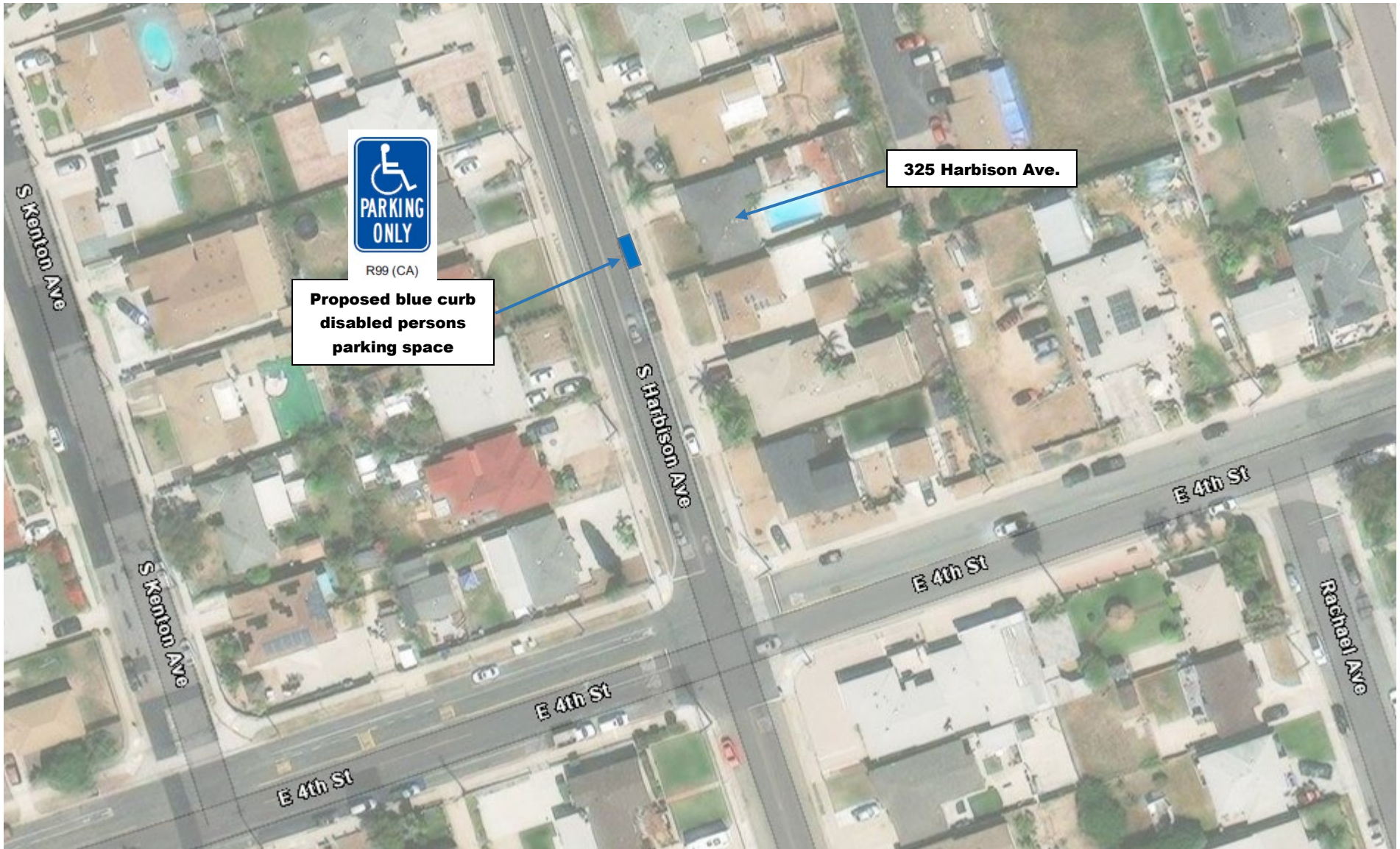
Exhibit A: Location Map with Recommended Enhancements (TSC Item: 2023-03)