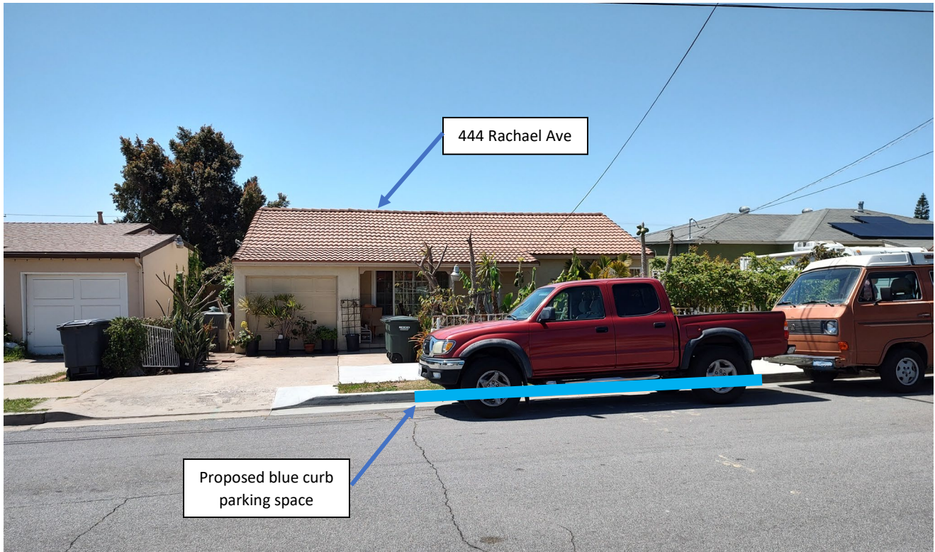
Location of proposed blue curb disabled persons parking space in front of 444 Rachael Ave (Looking West)