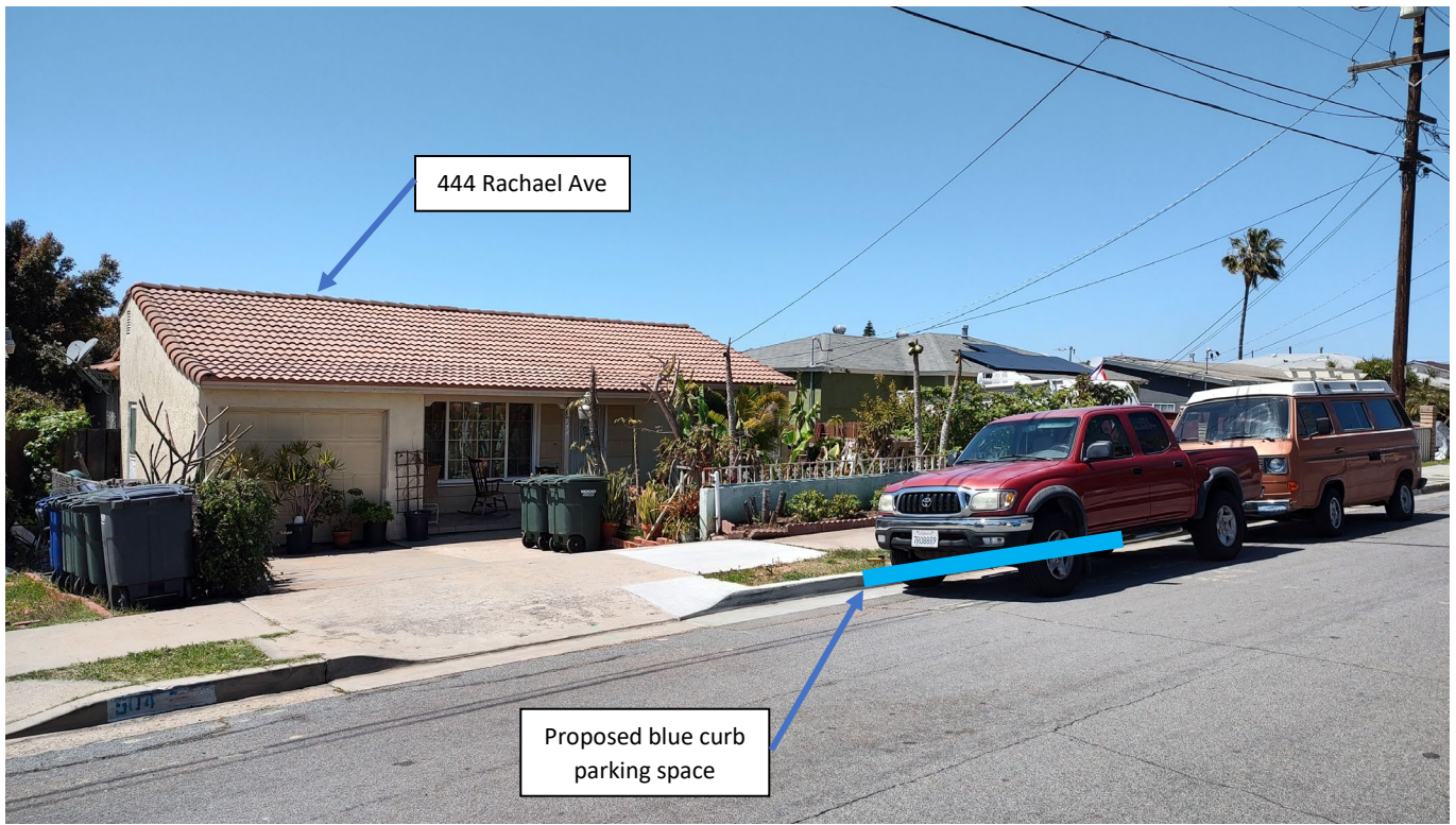
Location of proposed blue curb disabled persons parking space in front of 444 Rachael Ave (Looking North-West)