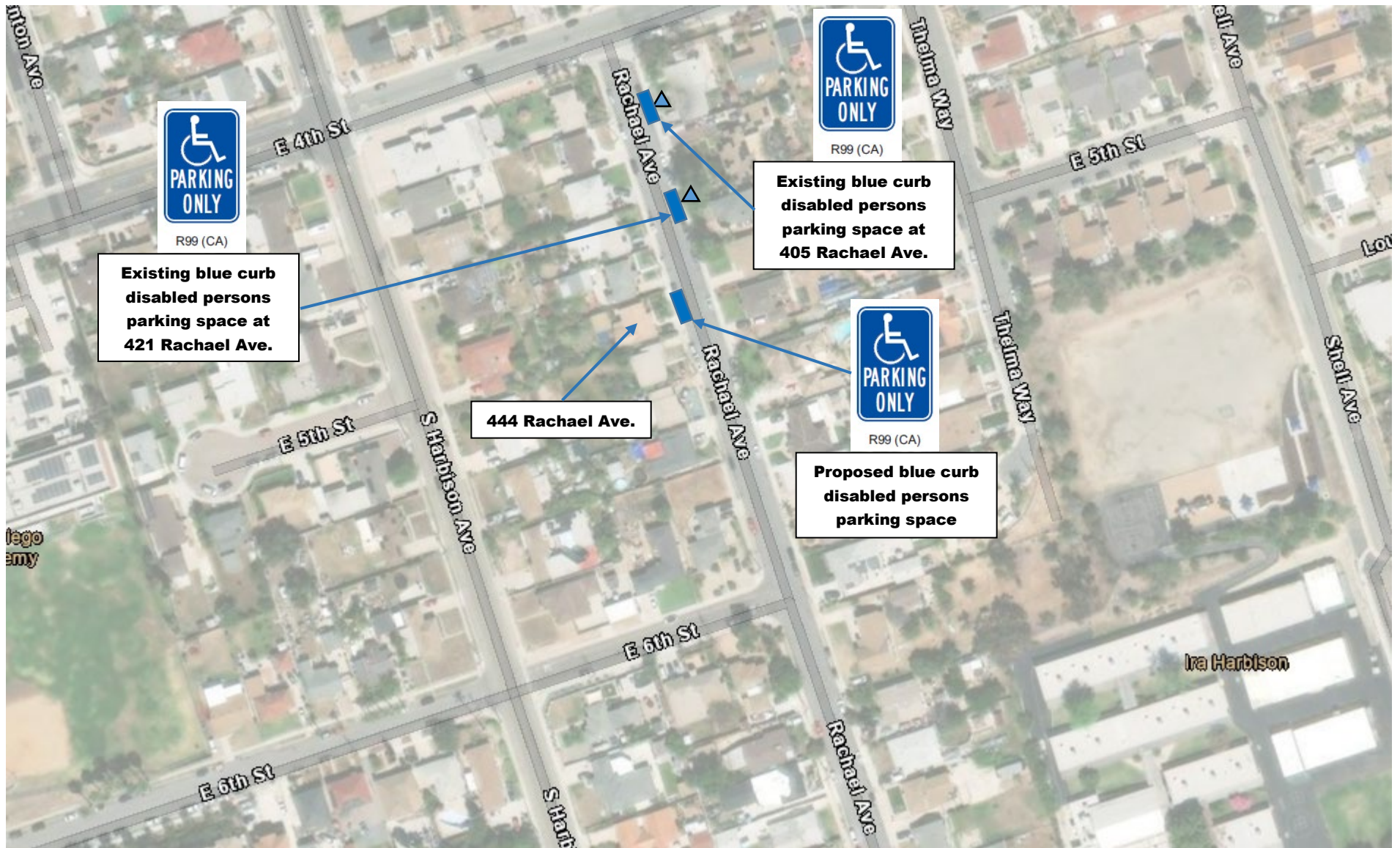
Exhibit A: Location Map with Recommended Enhancements (TSC Item: 2023-04)