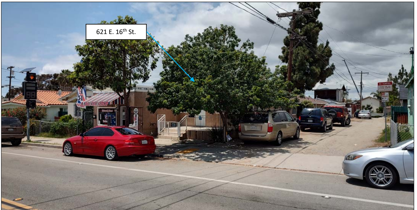
Photo of the alley adjacent to residence at 621 E. 16 th Street (Looking North-West)