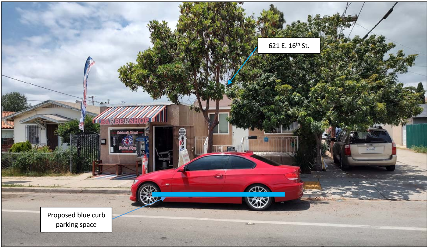
Location of proposed blue curb disabled persons parking space in front of 621 E. 16 th Street (Looking North)