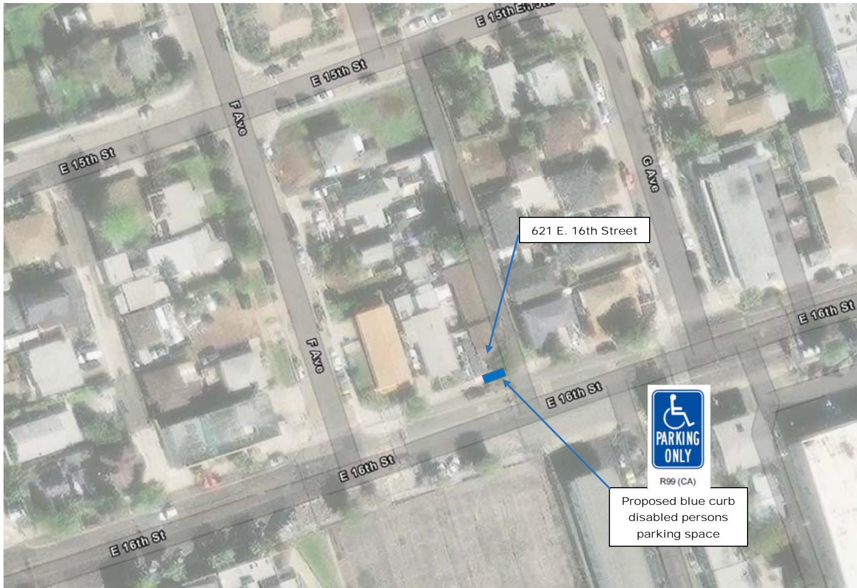
Exhibit A: Location Map with Recommended Enhancements (TSC Item: 2023-09)