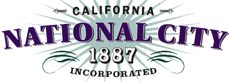
Exhibit A - Project Location and Concepts