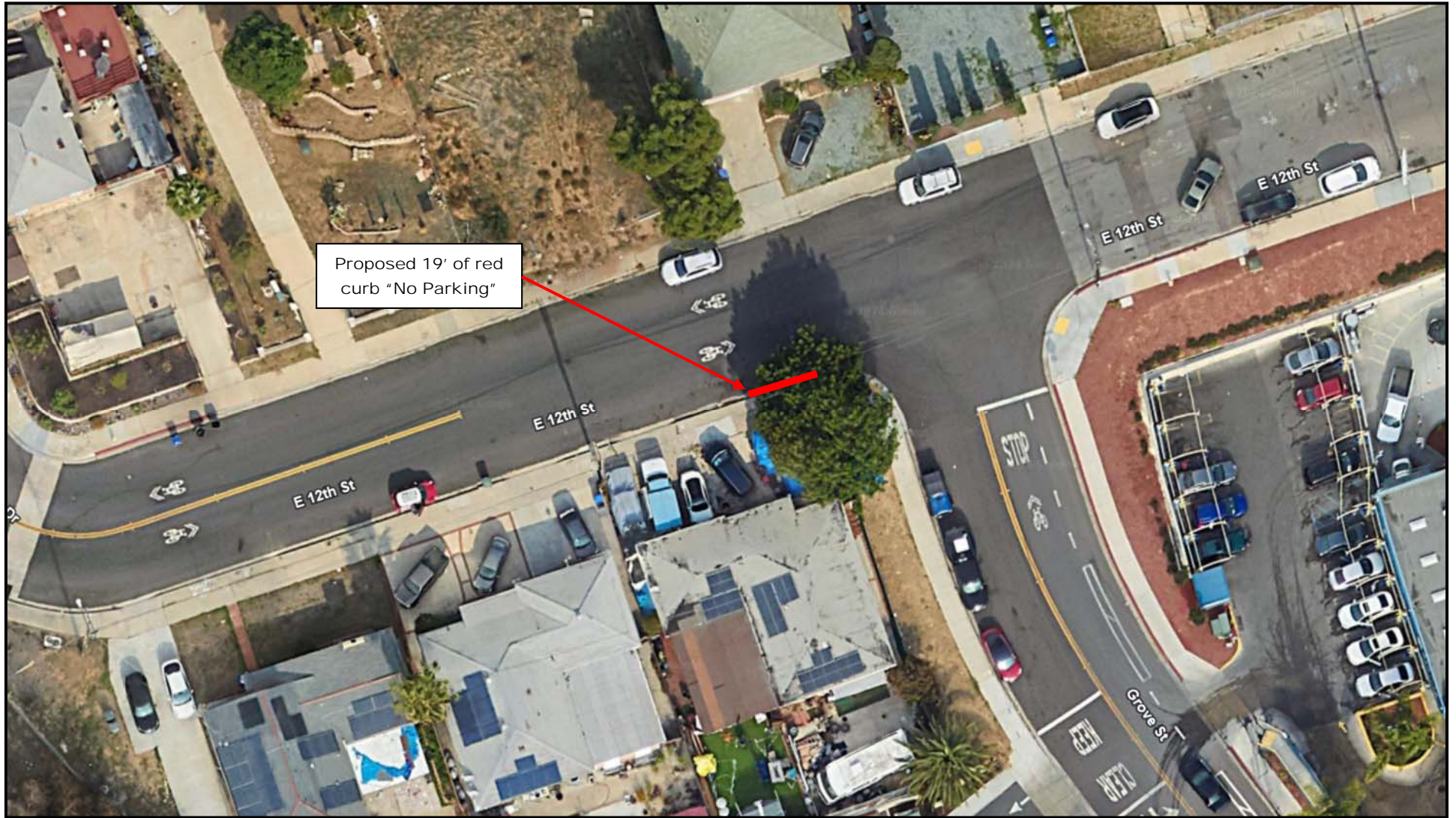
Exhibit A: Location Map with Recommended Enhancements (TSC Item: 2024-02)