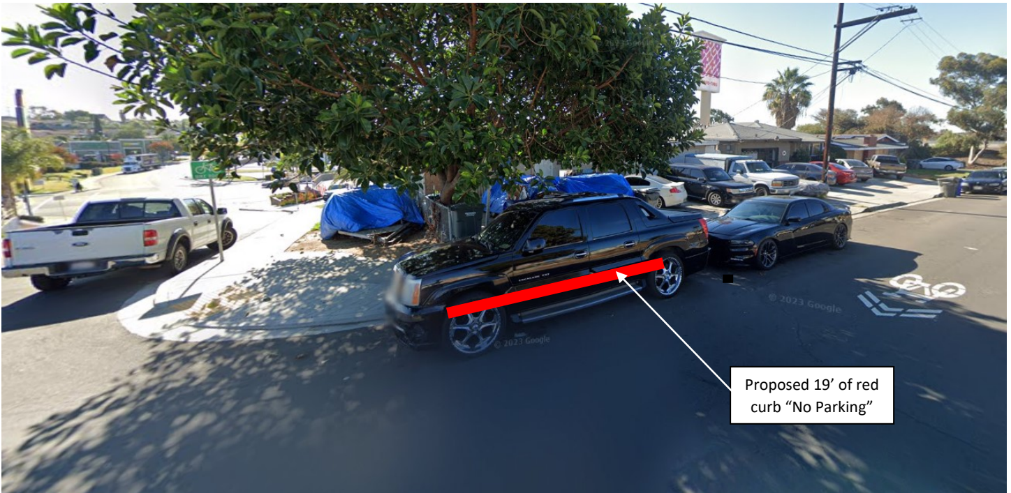
Location of proposed red curb "No Parking" on E 12th Street (Looking South)