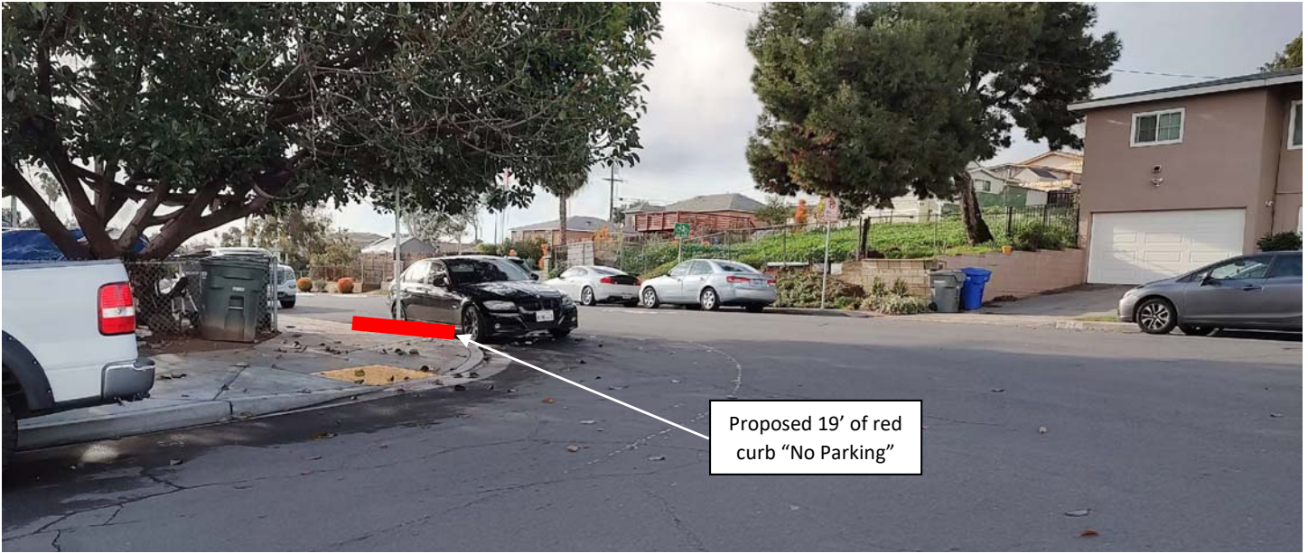
Location of proposed red curb "No Parking" on E 12th Street (Looking West)