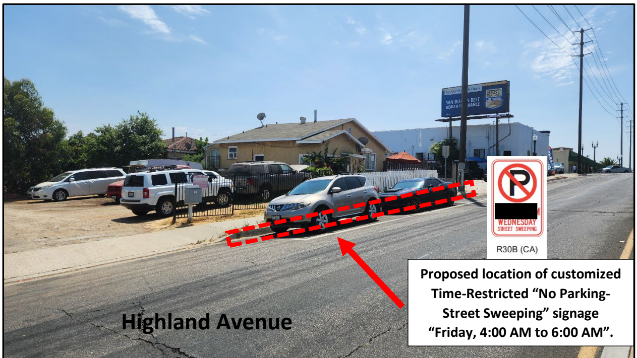
Location of proposed time restricted "No Parking Street Sweeping" signs (looking southeast)