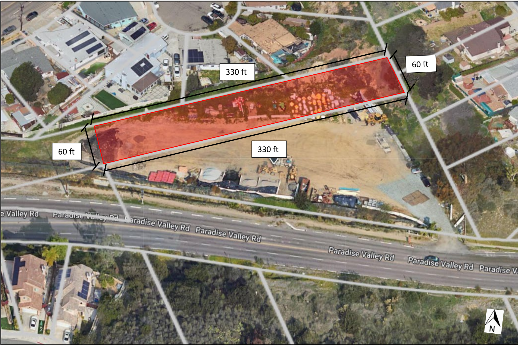
Location Map 2 – showing in red the proposed portion of the City property to be vacated