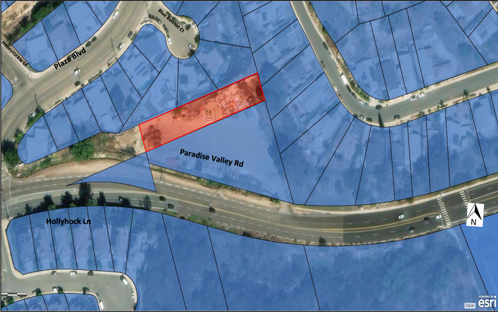
Location Map 1 – showing in red the proposed portion of the City property to be vacated