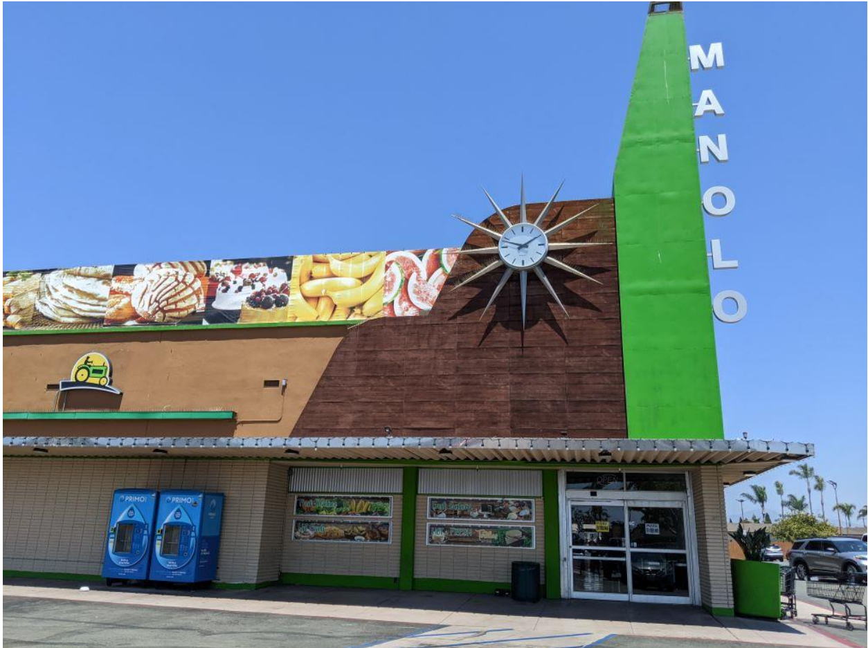
Photo of the proposed location

An environmental scan was conducted on Wednesday, July 3, 2024, for a proposed upgrade of an existing Type 20 off-sale alcohol license to a Type 21 at 303 Highland Avenue. The proposed location is a full-scale grocery store surrounded by other commercial uses on Highland Ave., and the streets running parallel and perpendicular to Highland in front of and behind the business are residential.