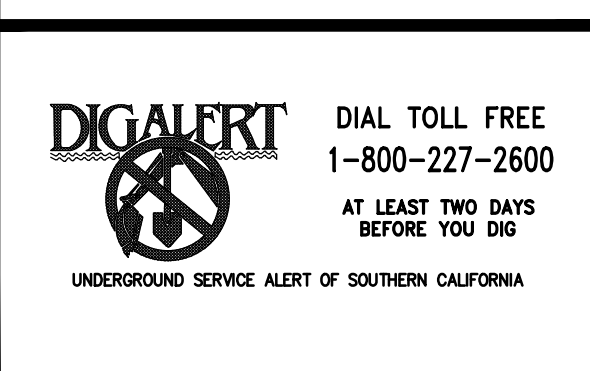
Exhibit A - Plan sheet

3+35.67 CL GRANGER AVENUE =0+00 E. 19TH STREET 3+80-8' RT. CONSTRUCT TYPE A-4 C.O. OVER EXIST. 18\"/> 4+90-8' RT. REMOVE EXIST. TYPE A C.O. HORIZ. ANGLE PT. EXIST. SDG&E POLE, CONTRACTOR TO PROTECT IN PLACE EXIST. SDG&E POLE, CONTRACTOR TO PROTECT IN PLACE RESTORE EXIST. SURFACE IMPROVEMENTS IN KIND, TYP.