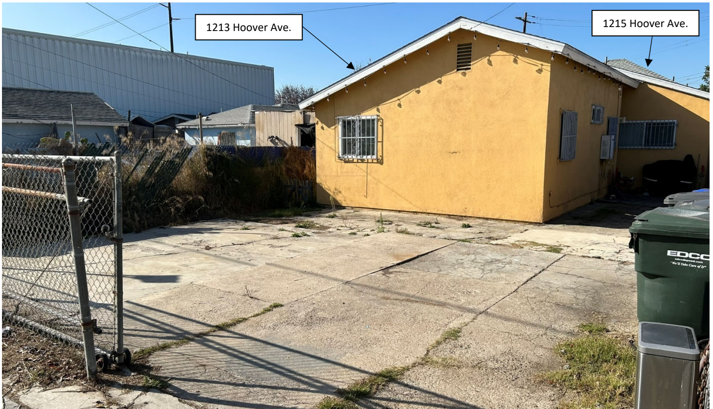
Photo of rear yard and access for 1213 Hoover Avenue (Looking Southwest from the alley)