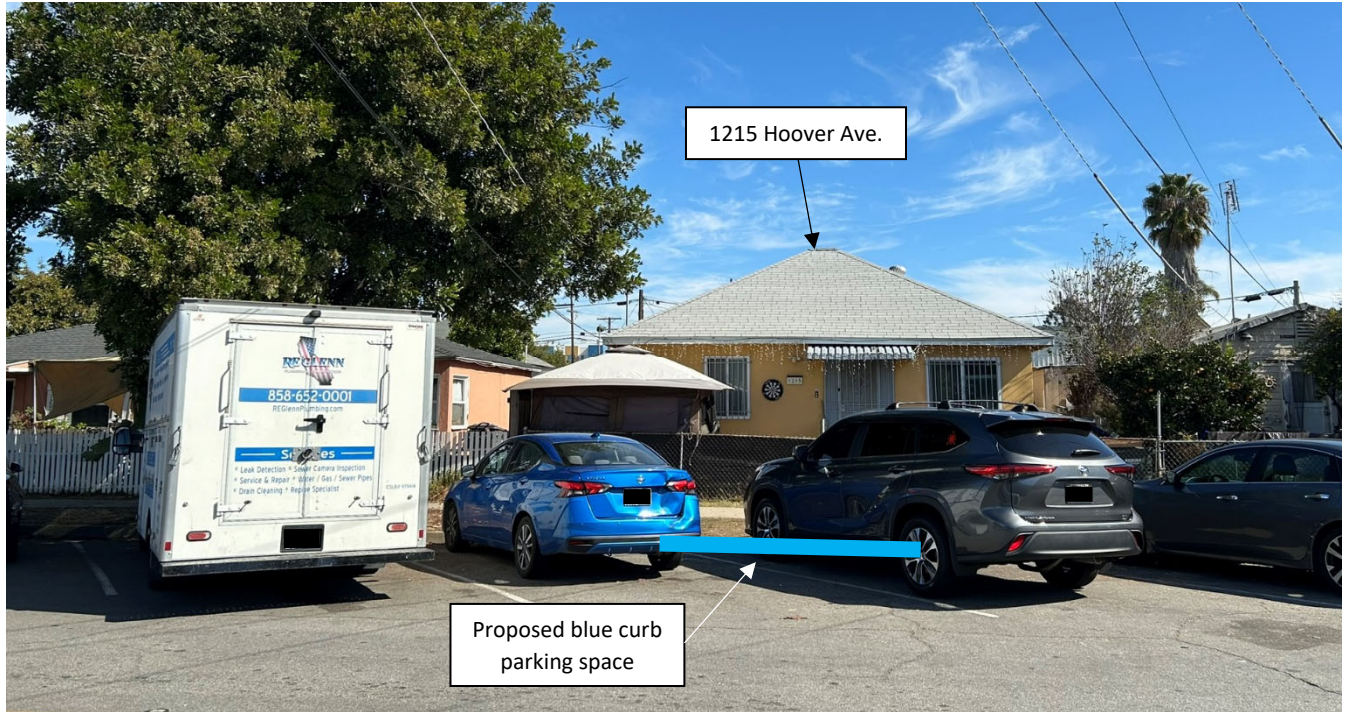
Location of proposed blue curb disabled persons parking space in front of 1215 Hoover Avenue (Looking East)