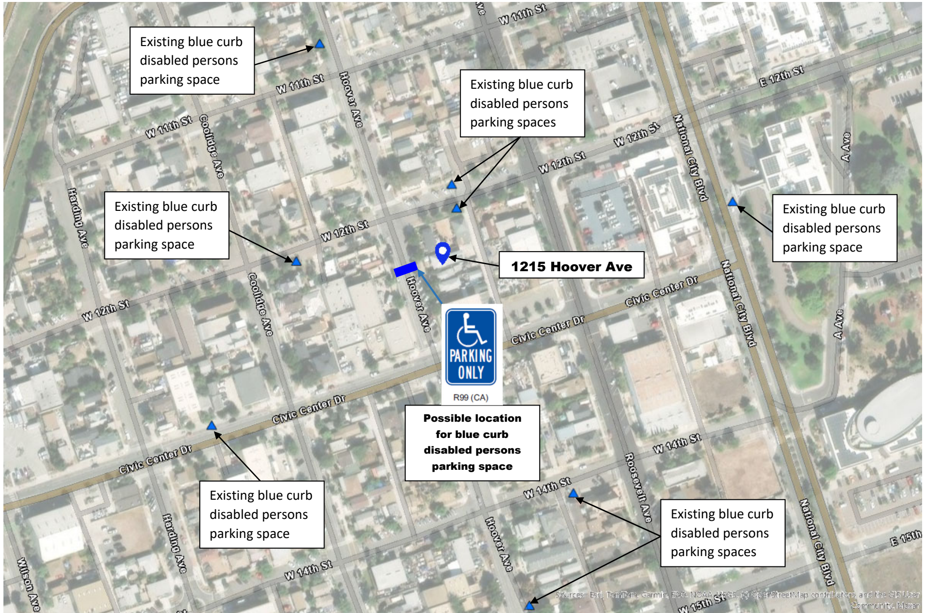
Exhibit A: Location Map with Possible Enhancements (TSC Item: 2025-07)