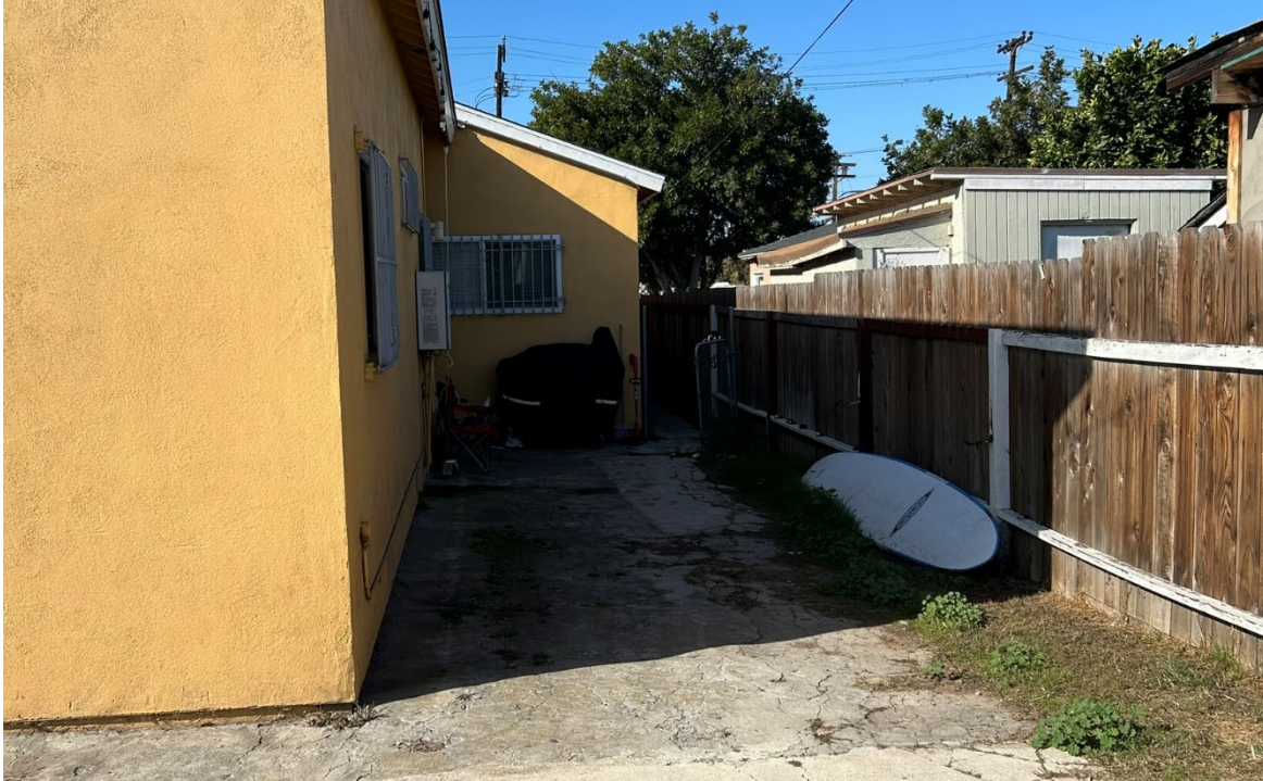
Photo of rear yard access to side yard (Looking West from rear yard)