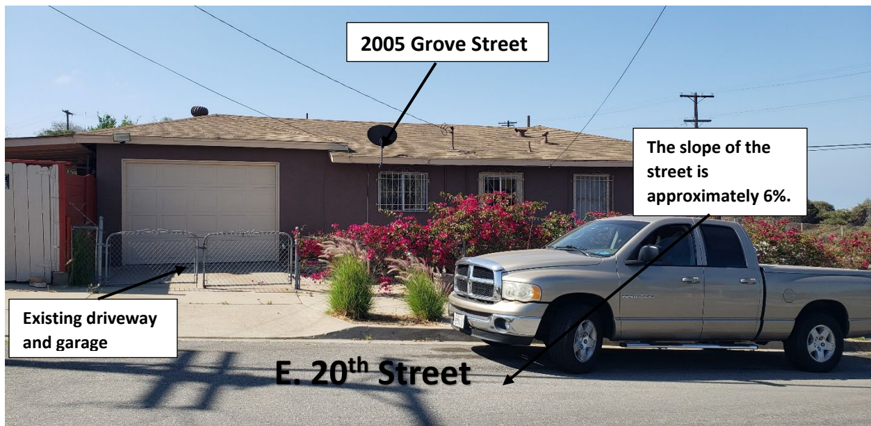
Location of proposed blue curb disabled persons parking space in front of 2005 Grove Street (looking south)