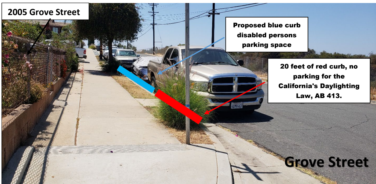
Location of proposed blue curb disabled persons parking space in front of 2005 Grove Street (looking southwest)