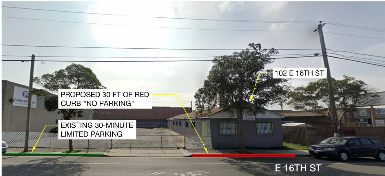
Location of proposed red curb "No Parking" in front of 102 E 16th St (looking South)