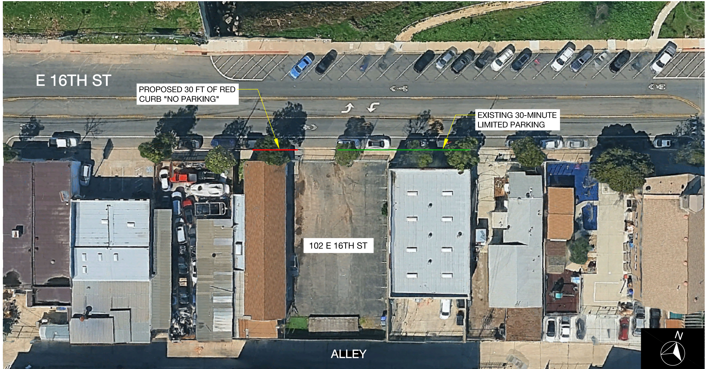
Exhibit A: Location Map with Recommended Enhancements (TSC Item: 2025-15)