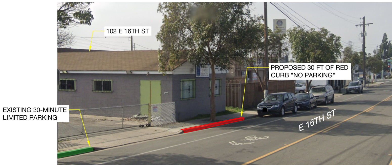
Location of proposed red curb "No Parking" in front of 102 E 16th St (looking West)